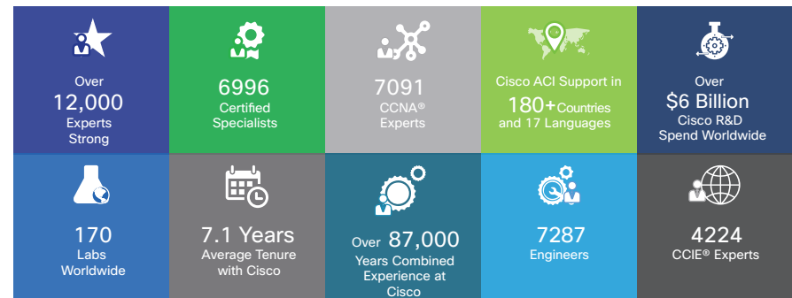
Figure 2. Cisco Services: Your Trusted Advisor

You can depend on Cisco Services to be your trusted advisor in every stage of your Cisco ACI deployment.