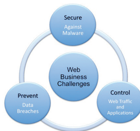
Secure Web Gateway: Secure, control, prevent. A comprehensive security solution to the business challenges of the web.

Customers enjoy low total cost of ownership (TCO), as these powerful applications are integrated and managed on a single appliance. Robust management and reporting tools deliver ease of administration, flexibility and control, as well as complete visibility into policy- and threat-related activities.