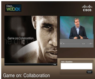
Cisco Collaboration: Game On