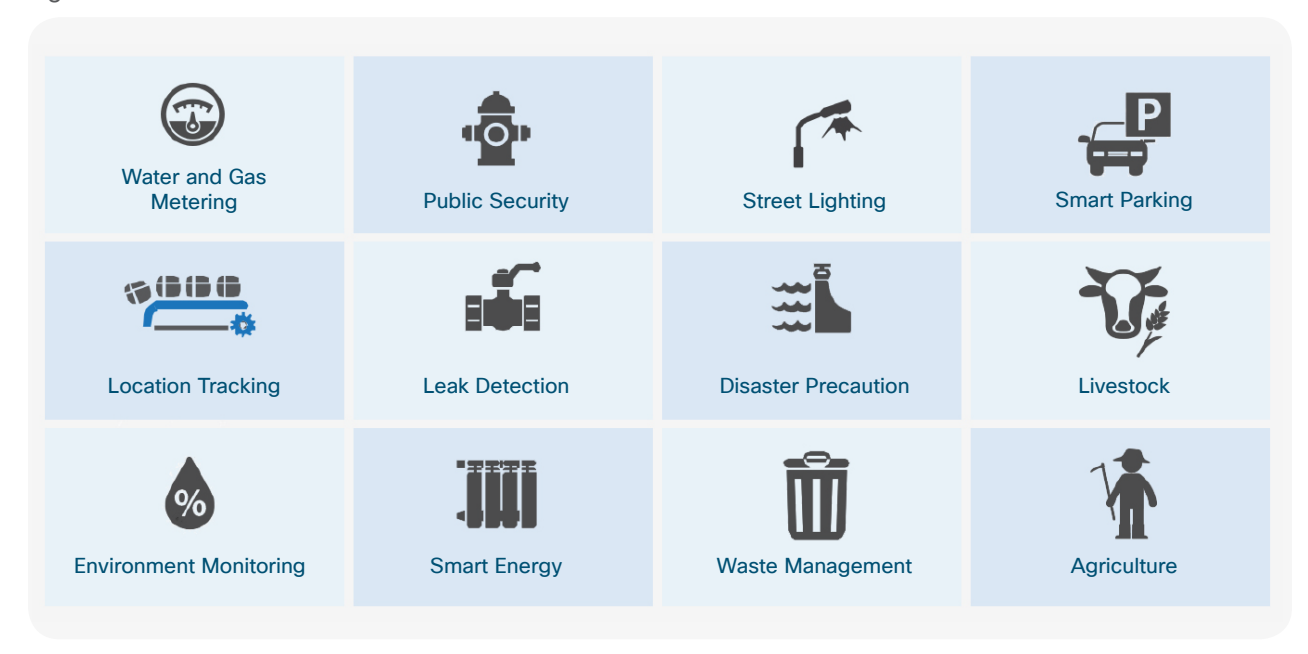
Figure 1. Customer use cases

The Cisco solution can be used to support the customer use cases shown in Figure 1.