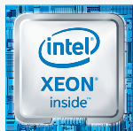
Cisco HyperFlex™ Systems with Intel® Xeon® Processors

Our platform includes hybrid or all-flash configurations, an integrated network fabric, and powerful data optimization features that bring the full potential of hyperconvergence to a wide range of workloads and use cases. Our solution is faster to deploy, simpler to manage, and easier to scale than the current generation of systems. It is ready to provide you with a unified pool of infrastructure resources to power applications as your business needs dictate.