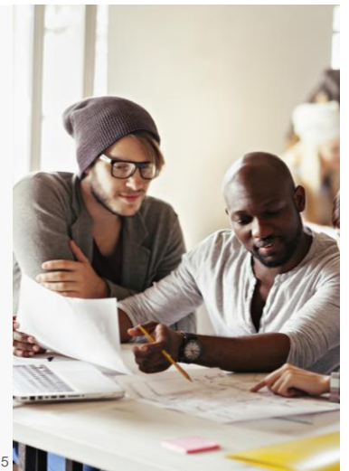
Map-R-Quantium Cisco Case Study 2015