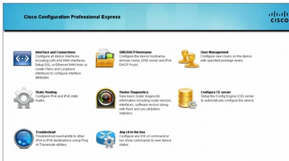
Figure 3. Cisco Configuration Professional: Wizard-Based Management

Group-based management features allow administrators to design security policies and authentication methods for each group, a feature that is essential when extending network resources to non-corporate-managed users and endpoints.